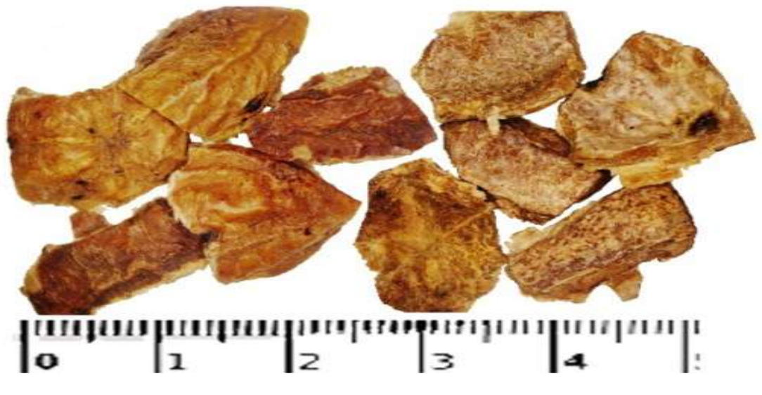
Figure: Pericarp excluding endocarp